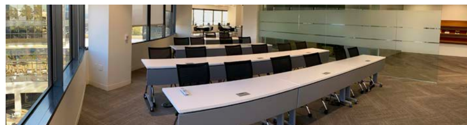
Newport Beach, California