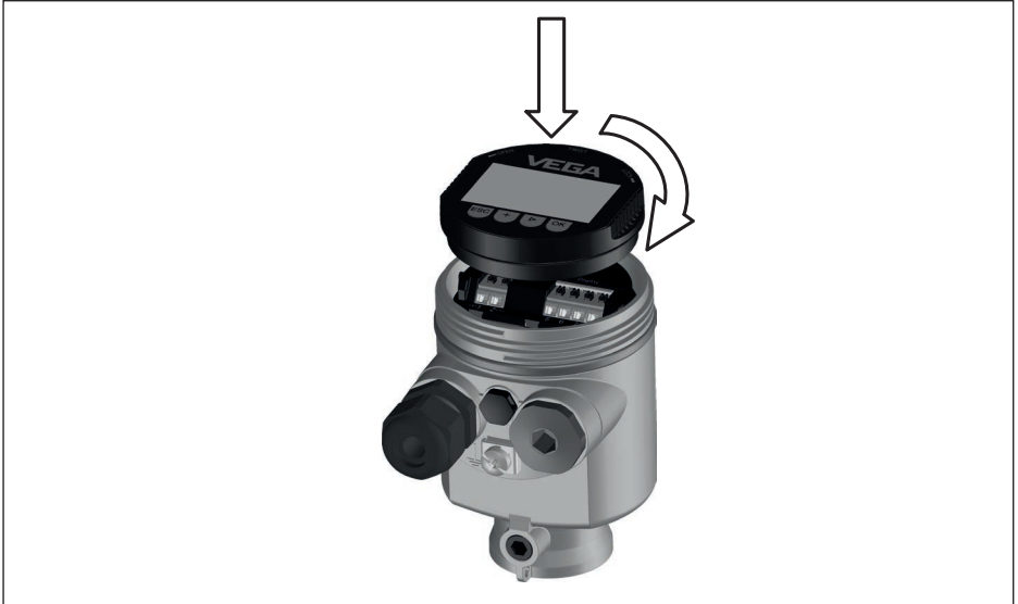
Fig. 1: Installing the display and adjustment module in the electronics compartment of the single chamber housing

Make sure that the intrinsically safe display and adjustment module PLICSCOM which was operated on non-intrinsically safe circuits is no longer used in intrinsically safe instrument.