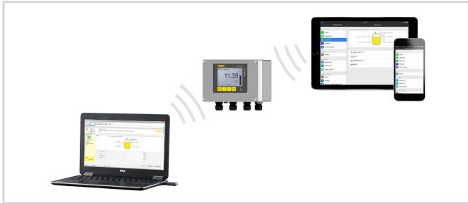
Wireless connection to smartphone/tablet/notebook

Operation is via a free app from the "Apple App Store", the "Google Play Store" or the "Baidu Store". Alternatively, adjustment can also be carried out via PACTware/DTM and a Windows PC.