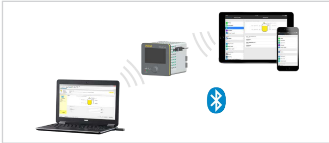
Wireless connection to smartphone/tablet/notebook

Operation is via a free app from the "Apple App Store", the "Google Play Store" or the "Baidu Store". Alternatively, adjustment can also be carried out via PACTware/DTM and a Windows PC.