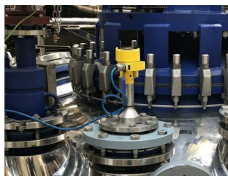
VEGA sensors have been an integral part of production at ACS Dobfar for more than ten years.

Pressure transmitters are also deployed in many places in this Italian plant, for example in the feed lines that transport finished products to the storage tanks. The VEGABAR 82 , for example, is used to both control production processes and monitor nitrogen neutralization. In some process areas, the VEGABAR 82 – with its ceramic diaphragm – is used in combination with PVDF process fittings and FFKM seals where highly aggressive substances are involved. The measurement applications range anywhere from vacuum to an overpressure up to 15 bar.