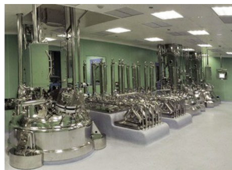
Level sensors monitor and control widely different product quantities.

On the main storage tanks, which have a height of 8 to 15 m and a diameter of approximately 2 to 3 m, a whole series of level sensors from VEGA are installed. There they monitor and control a wide variety of products. Besides raw materials, solvents and acids are also stored in the tanks. "We place a number of different requirements on the instruments at the same time. First and foremost, all the sensors we install must have ATEX approval. We also recently began to standardize our pressure transmitters according to SIL," explains Brucoli further.