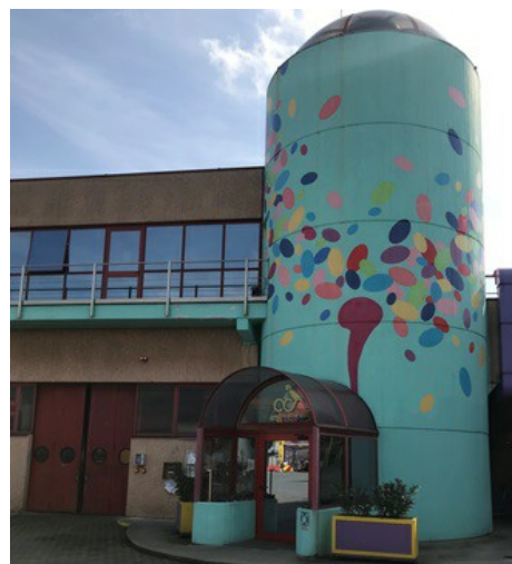
Headquarters of ACS Dobfar in Tribiano near Milan.

"We're using mainly VEGAPULS non-contact radar and VEGAFLEX guide wave radar level sensors on our raw material and waste water tanks. And since the market launch of VEGAPULS 64 non-contact radar in 2016, we've been using it more and more in our reactors," explains Lino Brucoli, – the person responsible for plant automation at ACS Dobfar – pointing out the main areas of application for radar level sensors.