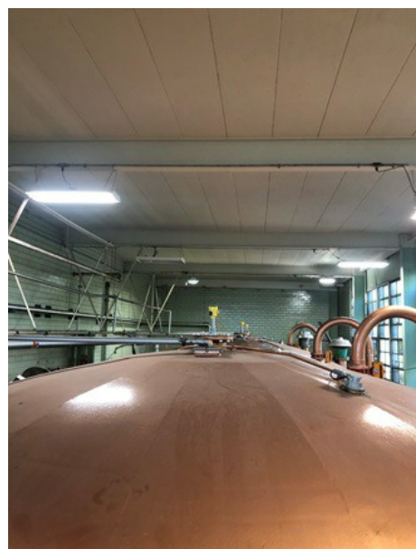
VEGAPULS 64 radar sensors with 80 GHz technology measure level in multiple fermenter vessels in the fermentation room.

The distillery wanted a low-maintenance solution that kept their employees' feet firmly planted on the ground without the need to regularly check the sensors. They discussed their needs with their local VEGA contact, and after learning more about the application, VEGA suggested a VEGAPULS 69 non-contact 80 GHz radar sensor .