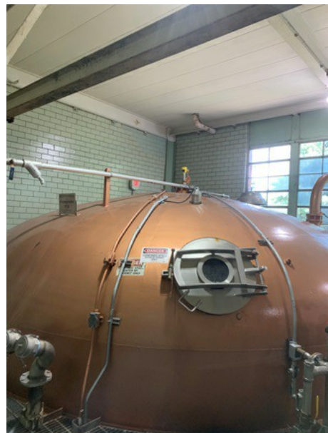
A bright yellow VEGAPULS 64 radar sensor perched atop this massive copper fermenter vessel measures level to output volume.

The distillery installed these sensors after careful consideration, researching their options, and consulting with VEGA. In the end, partnering with VEGA was the right decision for them because of the product and the service they receive.