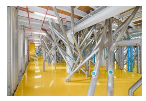
The piping network conveys the intermediate products to the roller mills. Every process step is comprehensively monitored during operation.

Levels are measured everywhere in the plant. Many different types of measuring instruments are employed for this. For example, there are 137 VEGACAP 63 capacitive probes in the wheat receiving station. However, level sensors are also used in the production of animal feed for process control. When the product is being pelletized, the pre-depot always has to be completely filled to ensure that the density of the pellets is correct. For that reason, an especially reliable measuring signal is required in the overflow cell in the pelletizing process, since further cells may or may not be opened, depending on the filling level. If the cell overflows, the dosing units shut down. Ultimately, if the situation is not rectified, even the mills are switched off. That means that the process planners need a 100 % accurate signal, otherwise the entire production plan can run off course.