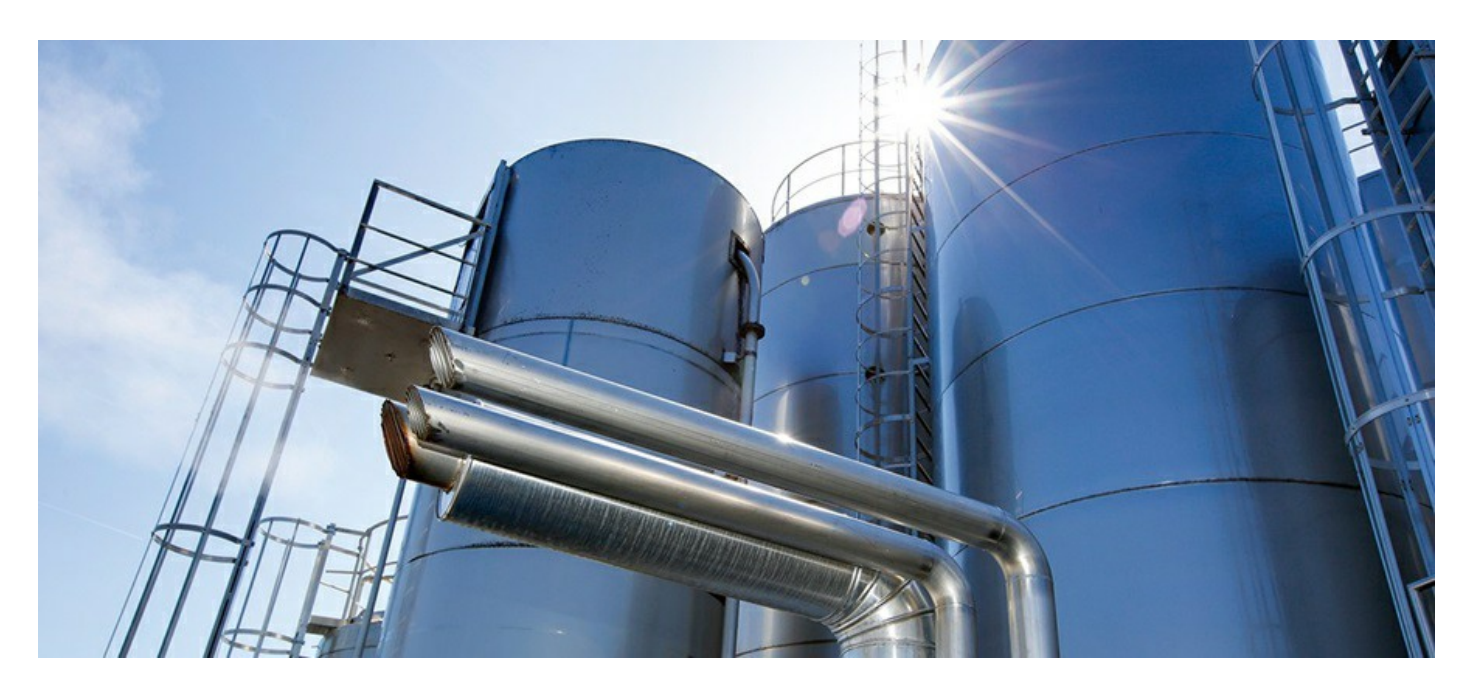
Meanwhile, the electrical engineering team had already heard that VEGAPULS 64, a new radar level transmitter, was under development. Schneider had high hopes that its high measuring frequency of 80 GHz would result in better focusing and higher resolution of the measuring signal. As soon as the first ones became available in 2016, all whey tanks were outfitted with the VEGAPULS 64 radar sensor.