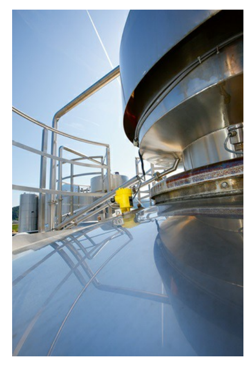
VEGAPULS 64 measures the level reliably in the whey tanks.

In the past, many tanks were equipped with level measuring systems, but these were usually delivered within the framework of a complete contract. In practice, this did not always prove to be particularly successful as the equipment suppliers were not level measurement specialists. A differential pressure system with sensors near the tank bottom was often supplied as standard equipment. From a maintenance point of view this was very labour intensive, as Schneider reports. "During the cleaning of the whey tanks, for example, mechanical damage to the diaphragm in the pressure transducers would occur again and again when a wrench fell into the tank." Another situation: the tanks are meticulously inspected at regular intervals. To do this, the milk technician has to climb into the tanks to inspect them from the inside. Again, there was a risk that the pressure transducers attached to the base could be damaged during each inspection.