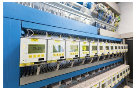
Control cabinet with VEGAMET 624 controllers for the underground solvent storage facility.

For a company like Brenntag, it is extremely important to monitor chemical inventories at all locations at all times. Lower inventory levels mean lower costs. Again, the right tool was required: tailor-made for this task, cost-effective and easy to use. The solution: VEGA Inventory System. It allows the instrumentation on tanks and silos to communicate directly with the local logistics centres as well as with the company headquarters. The user-friendly software accesses not only the current measurement data, but also past consumption data, optimum order quantities and future planning targets.