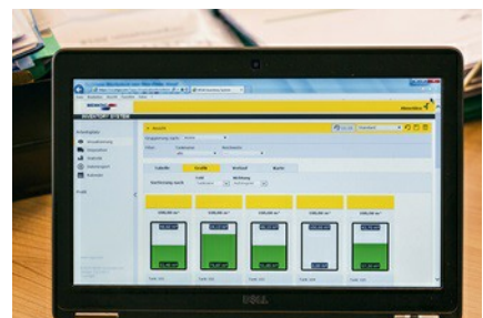
Inventory management with VEGA Inventory System.

Thanks to VEGA Inventory System , those responsible for logistics and technology in the company become essentially system administrators: They can easily integrate additional locations into the system and also grant access rights to Brenntag customers. Level data recording over a longer period of time allows an assessment of business development up to the present and thus a forecast for the future. The automated flow of information with its digital transparency offers long-term advantages for the entire supply chain: early information for the supplier and security of supply for the customer.