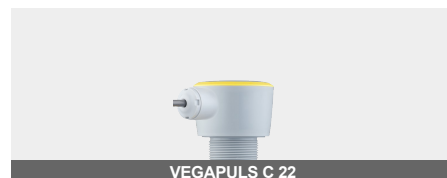
VEGAPULS C 22