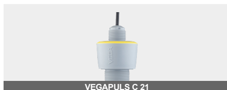
VEGAPULS C 21