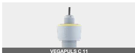
VEGAPULS C 11