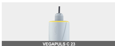
VEGAPULS C 23