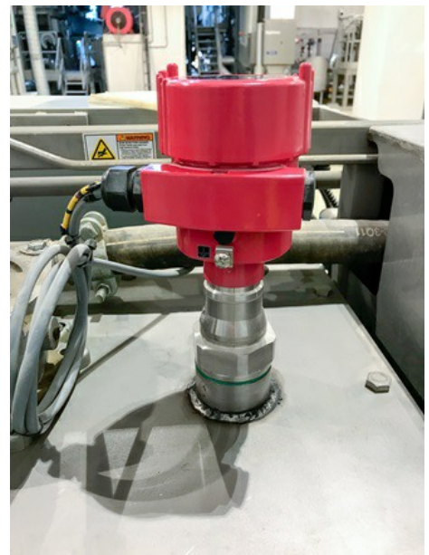
Notice that these VEGA sensors are not yellow, but the typical Progroup red.

In August 2018, the Progroup engineering team installed the VEGA sensors themselves and, thanks to the familiar plics® adjustment concept, commissioned them without any problems. As usual, the display and adjustment module PLICSCOM is used for setting up and commissioning the plics® sensors as well as displaying the measured values on site. A PC or a special software is not required. The display and adjustment module can be inserted into the sensor and removed again without having to interrupt the power supply. The new optional Bluetooth feature allows the sensor to be adjusted wirelessly from a distance of approx. 50 meters. Since no additional fittings or special connectors were needed to install the instrument, the installation and commissioning costs were also minimal. The most important advantage, however, is certainly that, thanks to continuous level detection, any leaks can now be detected and remedied in time to avoid shutting down the paper machine.