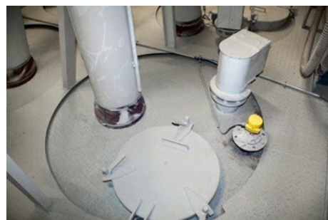
This photo shows how narrow the silos are and why VEGAPULS 69 performs so well. There is hardly any room for the sensor, yet its narrow beam angle allows it to work reliably in spite of that.

The sensor is now being used in more than 10,000 installations worldwide. Its key advantages are its high transmission frequency of 80 GHz and antenna size of about 75 millimeters with a beam angle of only 4°. This allows the 80 GHz beam to measure reliably right past internal installations or buildup on the vessel wall.