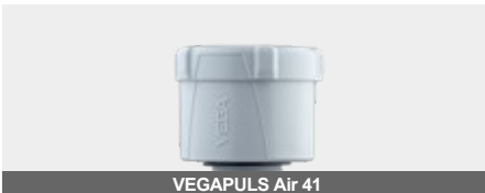
VEGAPULS Air 41