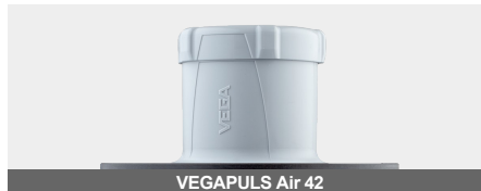
VEGAPULS Air 42