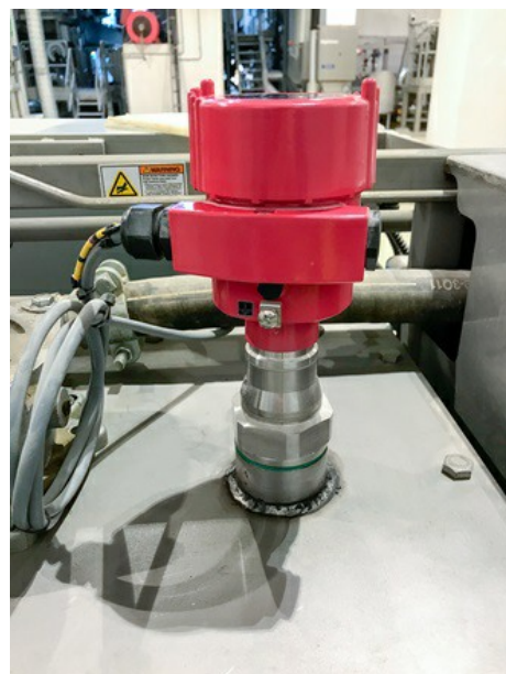
Notice that these VEGA sensors are not yellow, but the typical Progroup red.

In August 2018, the Progroup engineering team installed the VEGA sensors themselves and, thanks to the familiar plics® adjustment concept, commissioned them without any problems. As usual, the display and adjustment module PLICSCOM is used for setting up and commissioning the plics® sensors as well as displaying the measured values on site. A PC or a special software is not required. The display and adjustment module can be inserted into the sensor and removed again without having to interrupt the power supply. The new optional Bluetooth feature allows the sensor to be adjusted wirelessly from a distance of approx. 50 meters. Since no additional fittings or special connectors were needed to install the instrument, the installation and commissioning costs were also minimal. The most important advantage, however, is certainly that, thanks to continuous level detection, any leaks can now be detected and remedied in time to avoid shutting down the paper machine.