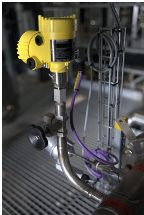
VEGABAR 83 pressure transmitters are in use.

Pyrolysis coke is a much sought-after raw material. Before it can be further processed, it has to be cooled down from 550 °C to ambient temperature in a controlled manner. It is then fed into the coke mill, where it is ground ultra-fine and pelletised into recovered carbon black. Multiple VEGA measuring instruments monitor the various process steps: