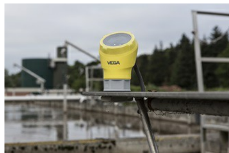
VEGAPULS with on-site indication.

In the wastewater industry for example, level measurement of lime in silos, which is used to stabilize the pH value, is an ideal area of application for the new instrument series. The radar sensors measure reliably irrespective of the intense dust generation during filling. Buildup and deposits on the container wall or on the sensor itself are also no problem thanks to the strong signal focusing.