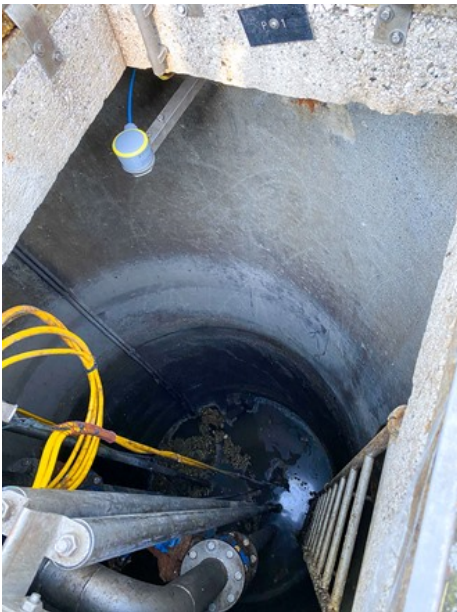
Limited conditions in the pump shaft in Hart

In the network the wastewater is collected via canals and then directed from the collecting basin to the Strass sewage treatment plant. There are about 100 pumping stations in the network and a variety of level sensors are installed in each one. These monitor the level – which can be from around 50 cm to 1 meter depending on the pumping station – and switch on the pumps according to the set limit value. “The pumps sometimes start up only 2 or 3 times a day, but sometimes 50 to 60 times,” explains Brandacher. For reasons of explosion protection, VEGAPULS WL 61 is installed in many of these shafts. This sensor is considered an all-rounder in the water and wastewater sector. The application spectrum of the radar sensor, which is designed specifically for water and wastewater measurement, ranges from level measurement in pump shafts and flow measurement in open flumes to river and lake gauging or level and discharge measurement at stormwater overflow basins . It has proven its worth above all through its robustness: The measurement is affected neither by changing medium properties nor by fluctuating process conditions such as temperature and pressure. In addition, the flood-proof IP68 housing ensures continuous, maintenance-free operation.