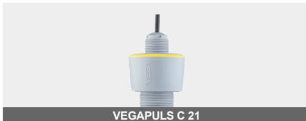
VEGAPULS C 21