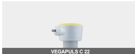
VEGAPULS C 22