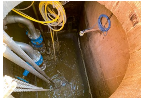
Round shaft in Buch

Although the association very much appreciates VEGAPULS WL 61, it wanted to try out the new compact VEGAPULS C 21/C 22 radar sensors . "We were just plain curious. The sensors are very interesting in terms of price, and in the wastewater sector, we increasingly need continuous level measurement, especially for simple applications."